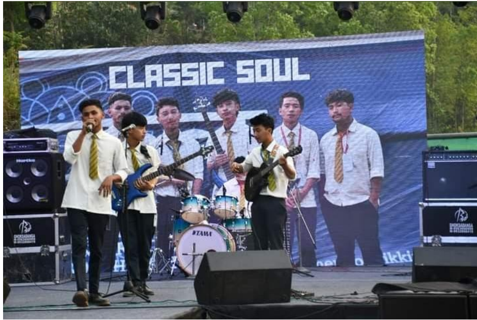
1. Participation in Music Festivals