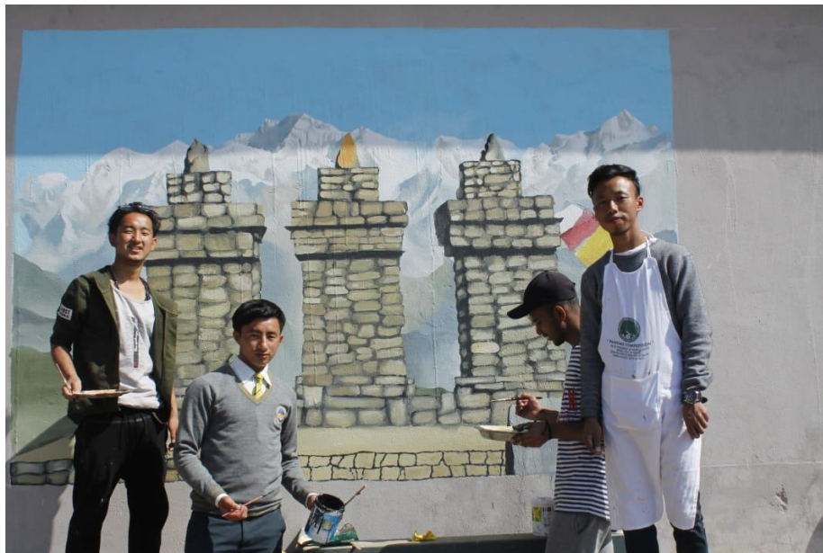
2. Creating Murals for campus buildings