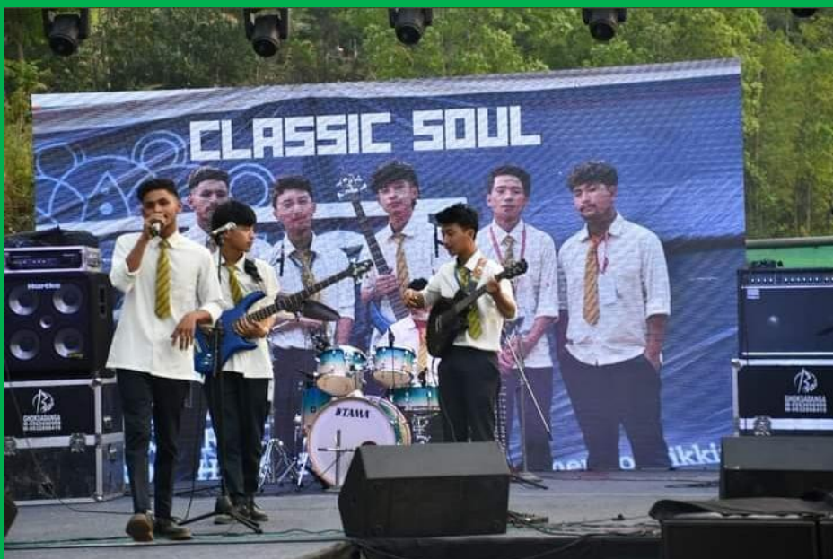
1. Participation in Music Festivals