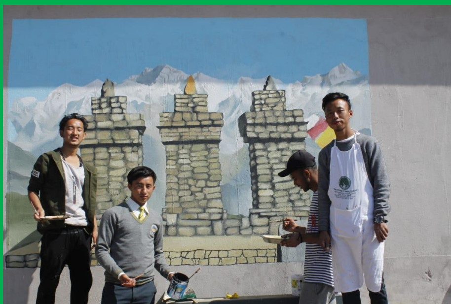
2. Creating Murals for campus buildings