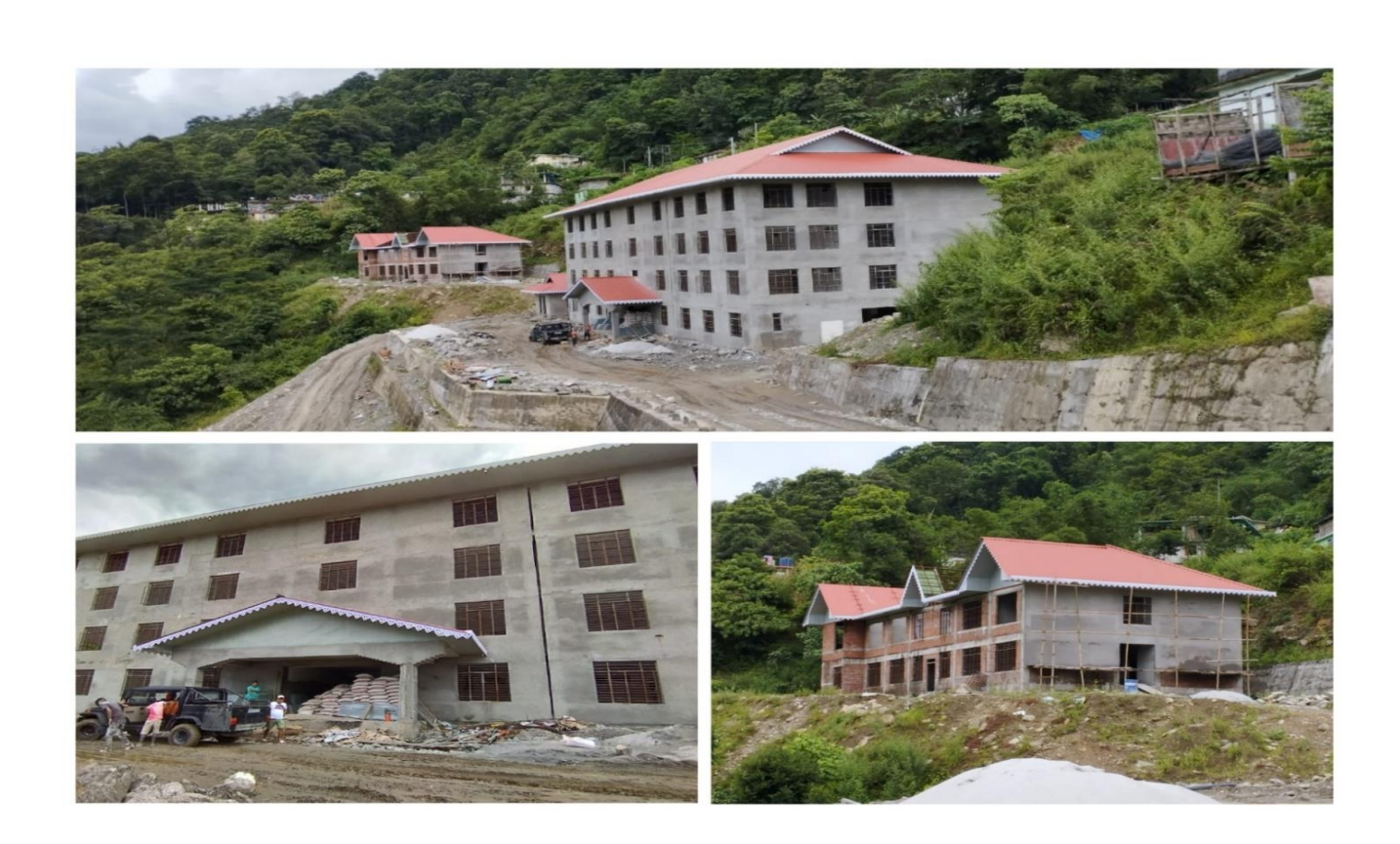
Main Campus under construction