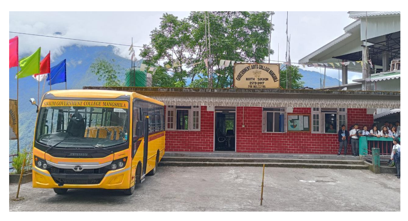
Mangshila College at present